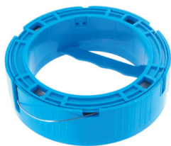
CUT-IT cutting wire square 0.6mm

This product is approved by - Peugeot - Citroen - Renault